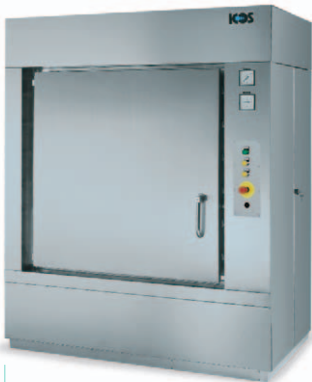
LOADING SIDE - Mod.: AV/L 914/A