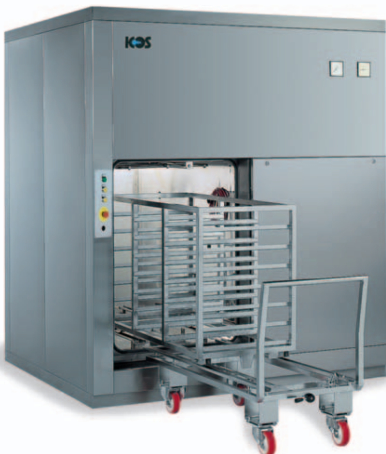
LOADING SIDE - Mod.: AV/S 913