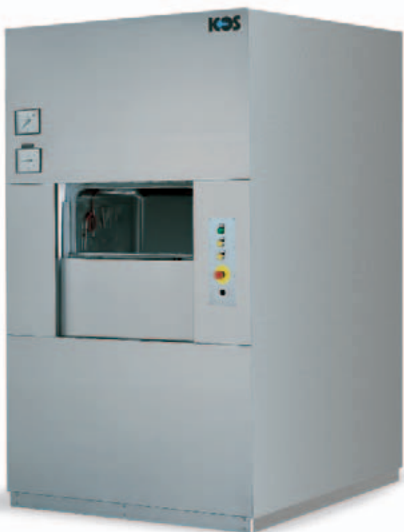
LOADING SIDE - Mod.: AV/S 601

WHEN SPECIAL CONDITIONS CALL FOR AUTOMATING THE LOADING AND UNLOADING OPERATIONS, ICOS CAN PROVIDE A RANGE OF SOLUTIONS COMPATIBLE WITH THE REQUIREMENTS OF THE CUSTOMER.